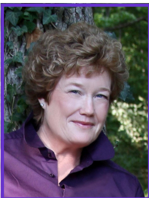
Woodard Photography Studio